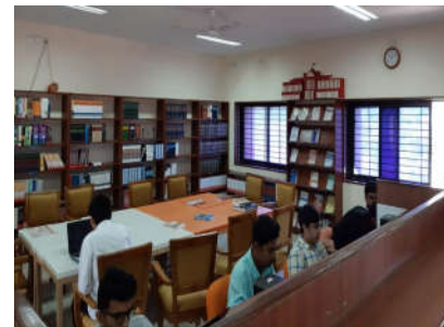
Faculty of Law Library